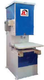
Carry Bag Punching Machine